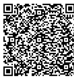
Seniors - P-Z

Seniors, please checkout the senior class page on our website under "Clubs and Activities" for pertinent information. https://www.pcsb.org/Domain/6081